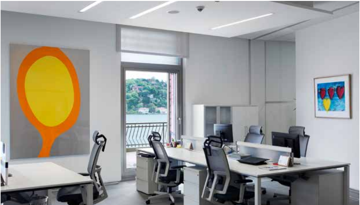
Markus Weggenmann, Painting #294 , 2007. Borusan Contemporary Art Collection.

Works from the exhibition were digitally hidden along the coastline between Kuruçeşme Park and Emirgan Woods, and were presented to be experienced by the audience on this route through the application. The application available for iOS and Android has been downloaded 844 times on iOS devices.