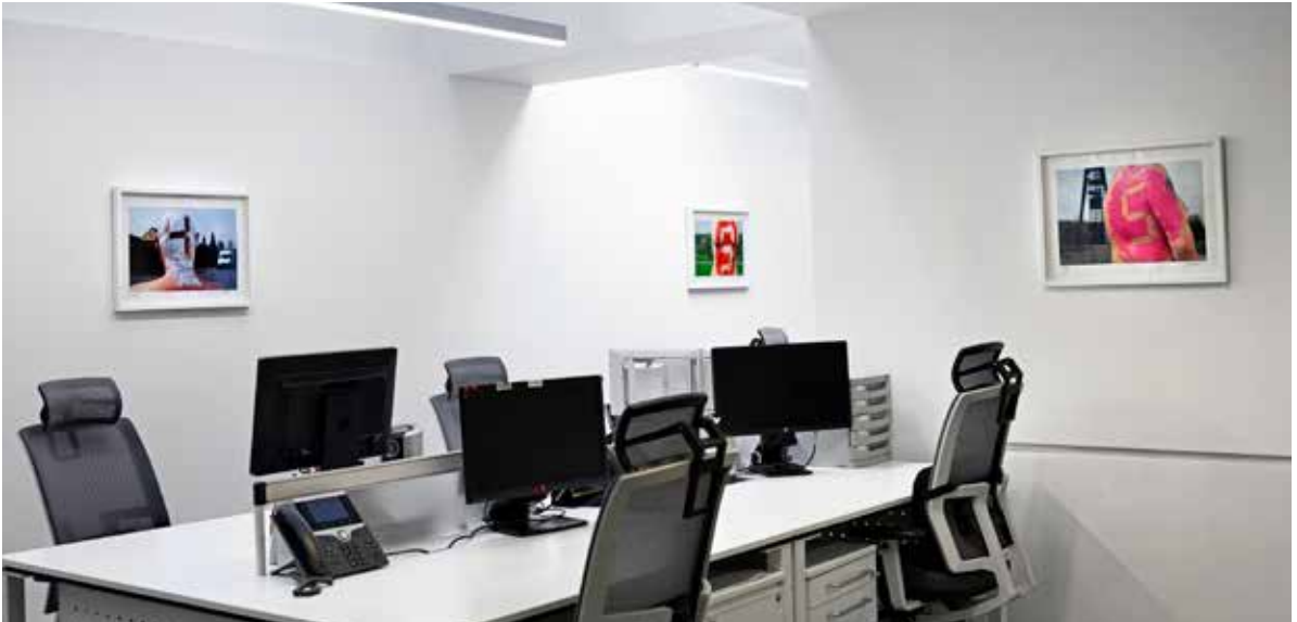
Tatsuo Miyajima, Counter Skin in Recklinghausen , 3, 4, 5, 6, 9, 2008. Borusan Contemporary Art Collection.

In 2021, two children's workshops were organized online and published on Borusan Contemporary's YouTube account. The workshops titled "I'm Making My Artist Robot" and "Stencil Workshop" organized for April 23 National Sovereignty and Children's Day were viewed 3,978 times.