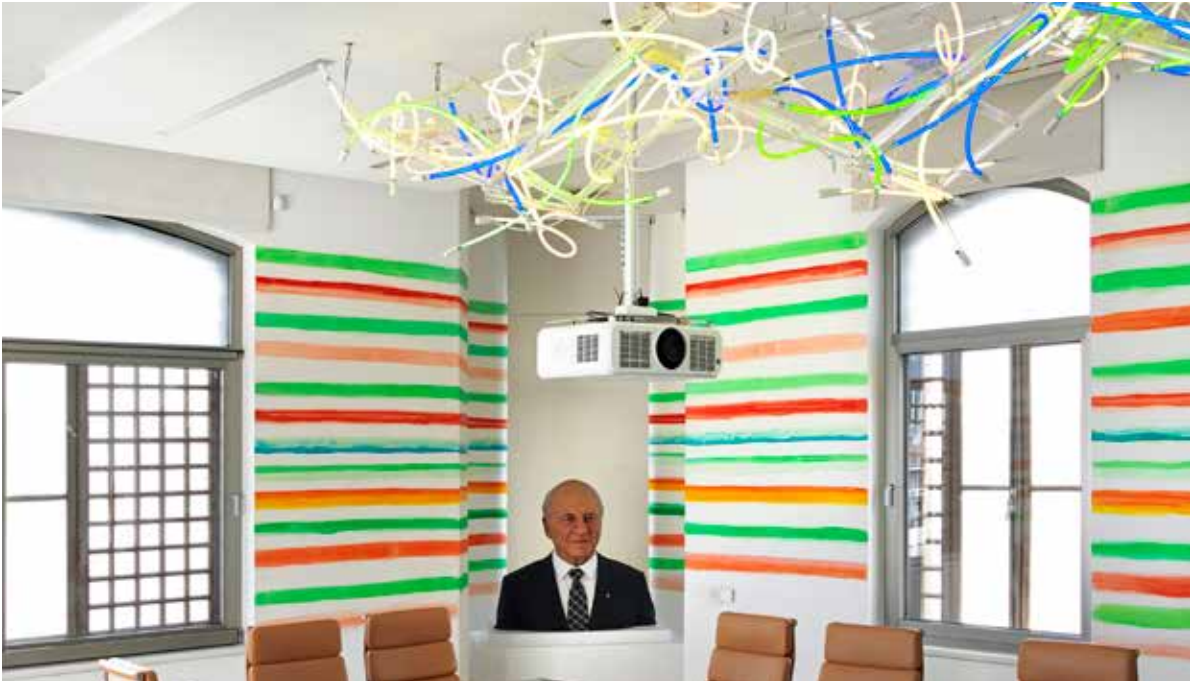
Sculpture: Jamie Salmon, Asım Kocabiyik , 2017. Borusan Contemporary Art Collection. Photograph: Hadiye Cangöğçe. Wall installation: Jerry Zenuik, Istanbul Wall Painting , 2007. Borusan Contemporary Art Collection. Photograph: Hadiye Cangöğçe

By exhibiting the Borusan Contemporary Art Collection, which has a history of 30 years, in Yusuf Ziya Pasha Mansion, also known as "Perili Köşk" (Haunted Mansion), one of the iconic structures of Istanbul, the Foundation introduced a unique art institution to the cultural scene of Istanbul.